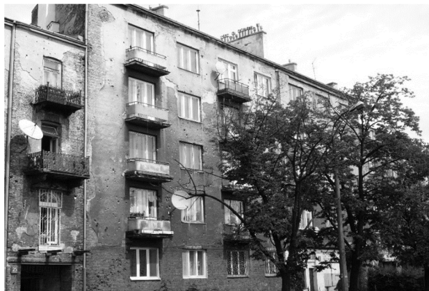
Fig. 1. View of the eastern facade of the building

Floors were made as Klein type. It is located 9 m from the edge of the road and about 20 m from the tram line (distance measured from the nearest rail head) and located directly above the metro tunnel.