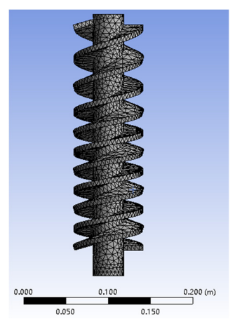
Fig. 2. Mesh division of geometry model for double helical separator