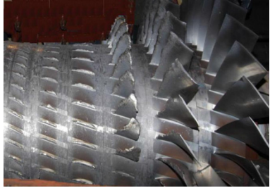
Fig. 2. Broken and worn blades